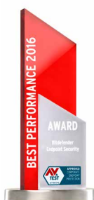
Bitdefender Endpoint Security AV-Test, February, 2017*